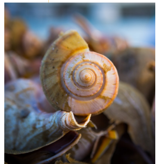
Map: All current and past ocean acidification monitoring locations in the Mid-Atlantic. Top right: Shellfish and mollusks are among the organisms believed to be most vulnerable to ocean acidification.